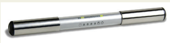
Figure 1 The MyDiagnostick device.

The MyDiagnostick ( www.mydiagnostick.com , MyDiagnostick Medical BV) is intended to discriminate AF from a normal cardiac rhythm (normal sinus rhythm, NSR) based on the ECG. This is achieved by an easy accessible device that can be used by both care providers like general practitioners, nurses, cardiologists and patients. The device has the shape of a stick (length 26 cm, diameter 2 cm) with metallic electrodes at both ends as shown in Figure 1 . The MyDiagnostick does not depend on any infrastructure or communication channels and can be used anytime, anywhere by simply holding the device in both hands for 60 s until the result is revealed. While holding the device, it will flash on the rhythm of the detected heartbeat. After 1 min, the MyDiagnostick either turns green, indicating a normal cardiac rhythm, or red in the case of AF. The MyDiagnostick has no buttons to select functions and switches automatically on when holding the device and will switch off after it has revealed the diagnostic result (red or green light) to the user. Due to the intuitive nature of the MyDiagnostick, diagnosis for AF can be