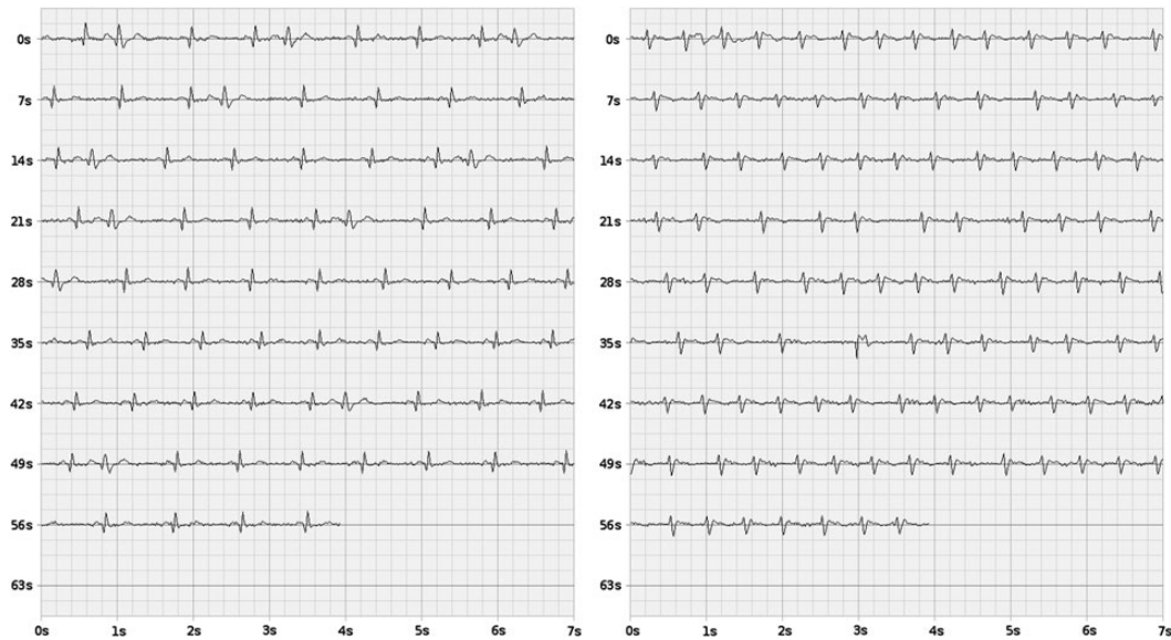
Figure 4 False-positive ECG tracings recorded by the MyDiagnostick. Left: an example of normal sinus rhythm with frequent premature ventricular extra-systoles. Right: an example of atrial flutter with an irregular coupling interval.

both hands for 1 minute and please report the color of the light; is it green or red.’ In contrast to other solutions including smartphone and blood pressure devices, 17,18 recording and reliable analysis of the ECG for detection of AF is embedded in the MyDiagnostick. This allows patients to monitor their rhythm anywhere-anytime, without the need for a communication channel, base station, or support from a health care professional. The 100% sensitivity allows the health care provider to only check the red-labelled ECGs to see whether the MyDiagnostick correctly identified AF. The high specificity prevents frequent ‘false alarm’, minimizing patient’s anxiety and workload for the health care professional.